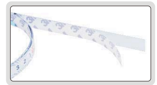
self adhesive back